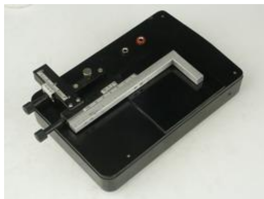
Custom made coil (additional purchase order)