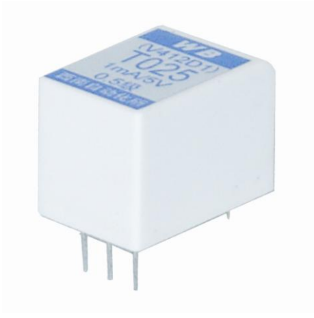
Dimensions: 31.5mm x 20.5mm x 22.5mm